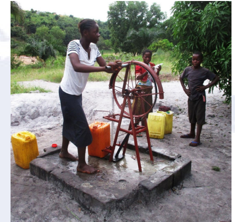
One of 3 hand-drilled wells with rope pump for the children and the neighbourhood population