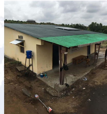
The Nursery, building before works ??

Today, thanks to a successful partnership between ASF Germany and ASF France, some funds have been unlocked and the work is underway. It's a big joy to see the first part of the project taking shape!