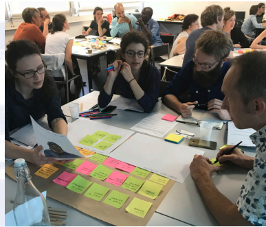
Stage A seminar in Marseille, France 2019

Recently, ASF-UK has been leading on revision of Challenging Practice modules which will be launched in July 2021, and has developed a new Stage A Online seminar with the next one being held in October 2021.