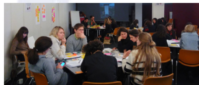
Stage A seminar in Paris, France 2019