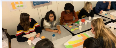
Stage A seminar in Paris, France 2016