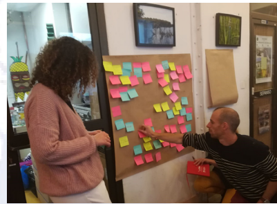
Stage A seminar in Bordeaux, France 2018

Future seminars could be built more on the idea of „learning together“, „learning by doing“, since we cannot pretend to have a lot of previous experience.