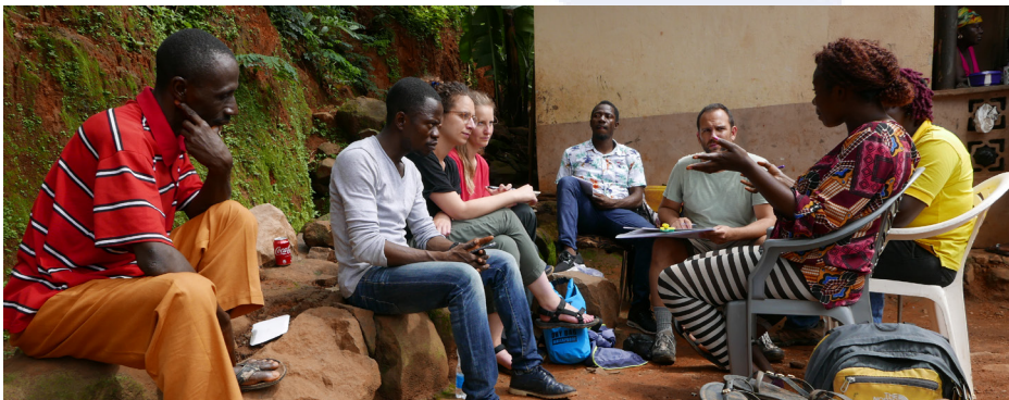
Stage B workshop in Freetown, Sierra Leone 2019